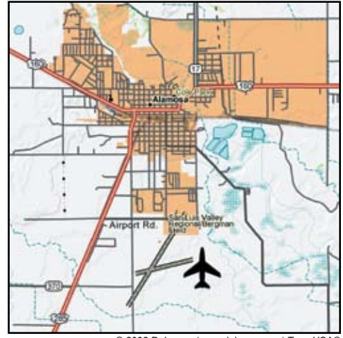
© 2002 DeLorme (www.delorme.com) Topo USA®