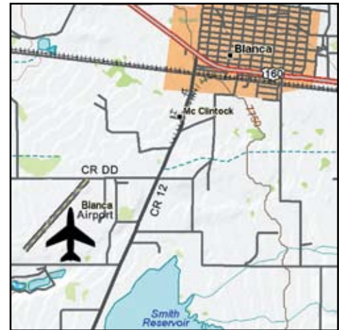
© 2002 DeLorme (www.delorme.com) Topo USA®