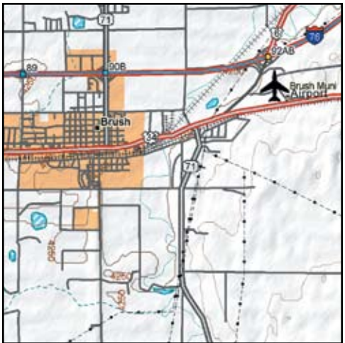
© 2002 DeLorme (www.delorme.com) Topo USA®

Lodging: Econo Lodge Microtel Inn Best Western Budget Host Empire Motel 877-477-5817 970-842-4241 970-842-5146 970-842-2876 Dining: True Grits Steakhouse Drovers Restaurant Peking Wok China Buffet Harry's Cafe W on Hwy. 34 1.5 miles W N on Hwy. 71 Downtown Brush Recreation: Brush Prairie Ponds Wildlife Area City of Brush Campground 2.5 miles S S on Clayton St.