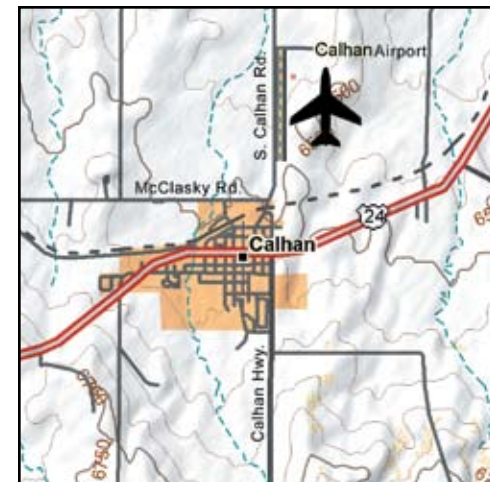
© 2002 DeLorme (www.delorme.com) Topo USA®