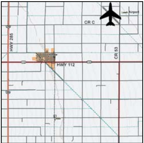
© 2002 DeLorme (www.delorme.com) Topo USA®

REMARKS -RWY 12 has 110' displaced threshold. -RWY 30 has 1345' displaced threshold. -Agricultural operations May-September. -60 ft. powerlines 200 ft. from RWY 30 end on both sides of centerline. -Airport unattended.