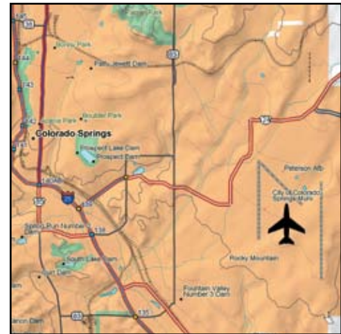
© 2002 DeLorme (www.delorme.com) Topo USA®