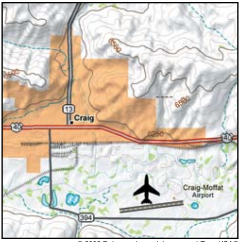
© 2002 DeLorme (www.delorme.com) Topo USA®

-RY 25 has +75 ft. trees 4000 ft. from threshold.