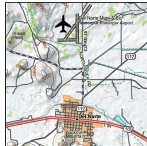
© 2002 DeLorme (www.delorme.com) Topo USA®

-Wildlife on and in vicinity of airport. -Mountainous terrain surrounds airport.