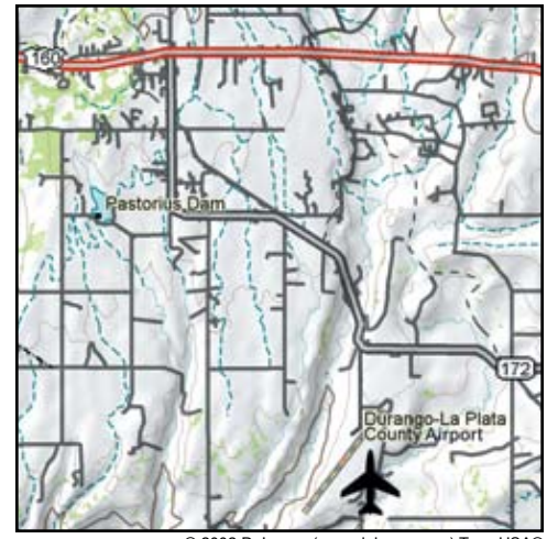
© 2002 DeLorme (www.delorme.com) Topo USA®