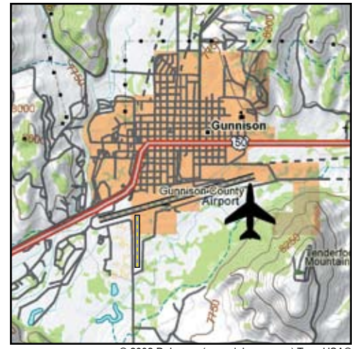
© 2002 DeLorme (www.delorme.com) Topo USA®

REMARKS -RWY 6 and 17 are right traffic. -Mountainous terrain surrounds airport. -Airport CLOSED 2230L - 0600L.