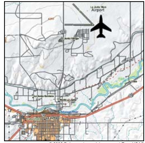
© 2002 DeLorme (www.delorme.com) Topo USA®