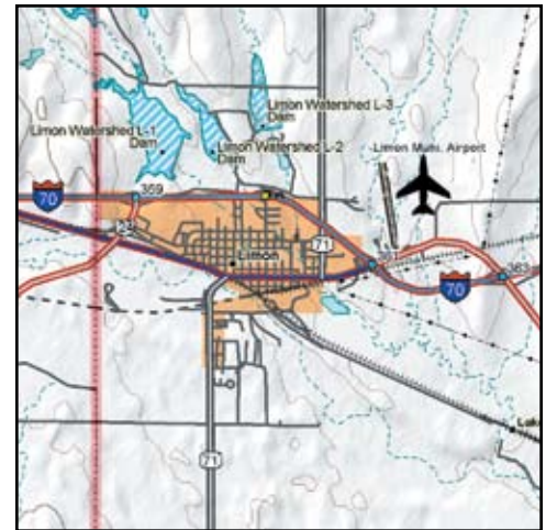
© 2002 DeLorme (www.delorme.com) Topo USA®