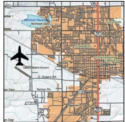
© 2002 DeLorme (www.delorme.com) Topo USA®