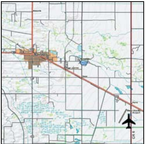
© 2002 DeLorme (www.delorme.com) Topo USA®