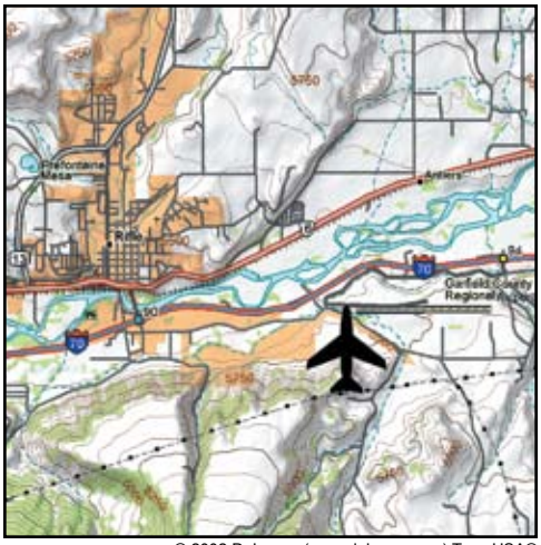
© 2002 DeLorme (www.delorme.com) Topo USA®

- RWY 26 right traffic. - Fuel available 24 hrs., self-service.