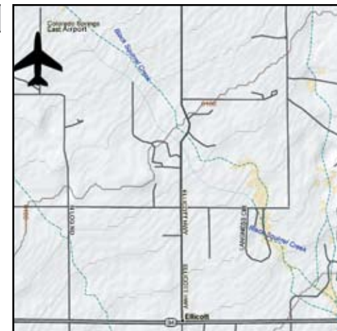
© 2002 DeLorme (www.delorme.com) Topo USA®