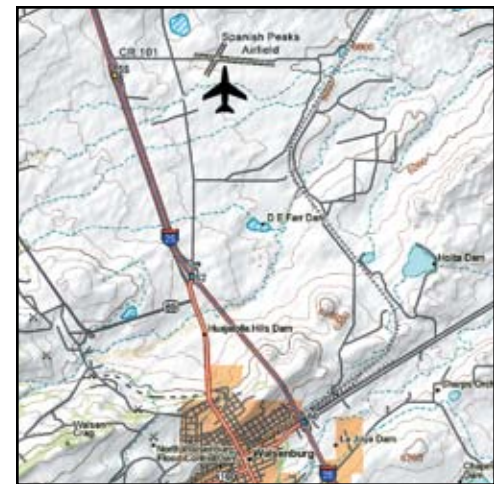
© 2002 DeLorme (www.delorme.com) Topo USA®